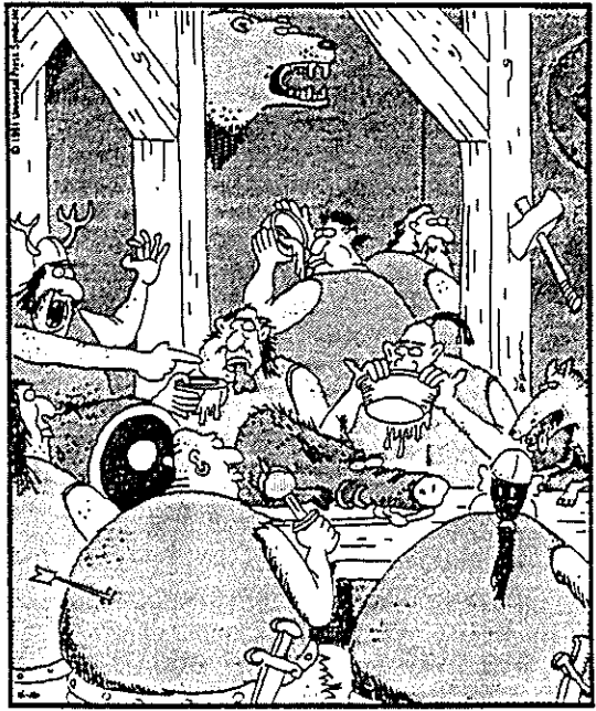
In a barbarian faux pas that quickly cost him his life, Garth is caught drinking gruel with his pinky fingers extended.